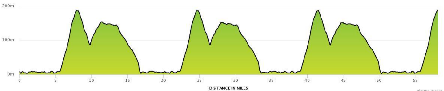
STAGE 2 - ROUTE PROFILE