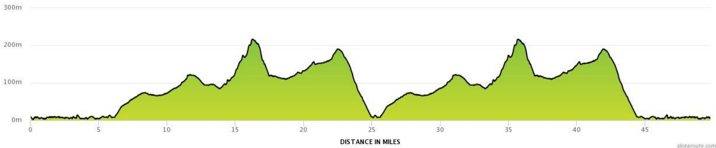
STAGE 3 ROUTE - ROUTE PROFILE